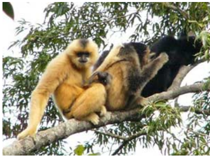
Hainan black-crested gibbon.